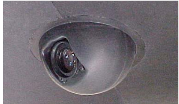
Figure 1 Procerus partner, Brandebury Tool, is the maker of the BTC-88 Fully Retractable Pan and Tilt Gimbal ( www.microuav.com ).