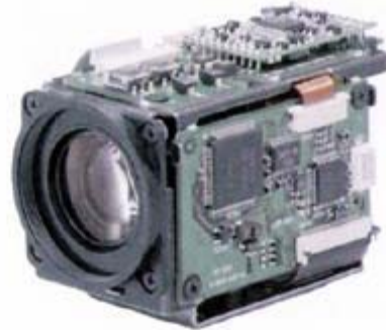
A setup application for the Sony FCB-IX 11 Camera can be found at www.sony.com/videocameras