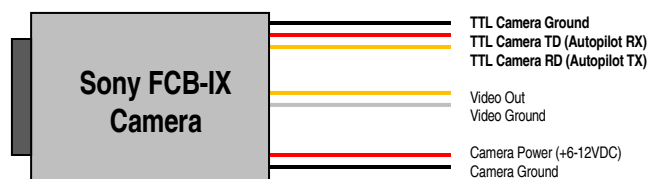
Pinout of Sony FCB-IX Video Camera